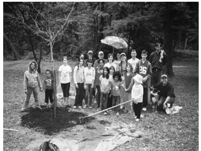
Group of volunteers shows off the tree planted during the Earth Day clean-up.